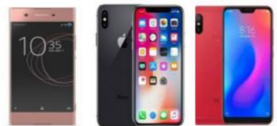
Fig.2. Mobile Android in Audio Program Orientation Mobility Model Social and Communication