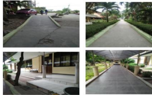
Fig.4. Environmental Campus Faculty of Education, State University Surabaya

6 the campus Faculty of Education, State University of Surabaya.